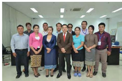
Below: The team behind the success of RentsBuy